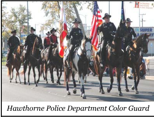
Hawthorne Police Department Color Guard