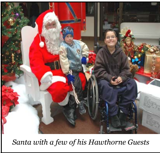
Santa with a few of his Hawthorne Guests