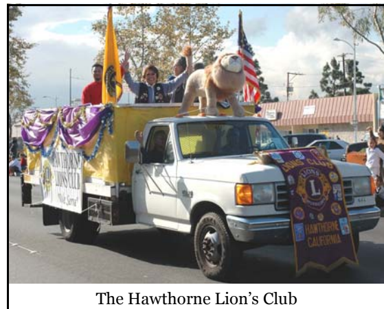
The Hawthorne Lion's Club