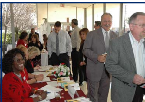
Hawthorne residents and business community members arriving for the Mayor's address

ers Insurance Agency, Guy Hocker Realtors, Los Angeles Air Force Base, Golden State Water Company, Plumbers Depot, Hawthorne Lions Club, Vought Aircraft Industries, Centinela Valley Union High School District, South Bay Ford, Hawthorne School District, Zaharoni Industries, Hawthorne Executive Group, Hawthorne Police Association, Evergreen Devco, Schnierow DDS, International Christian Center, Northrop Grumman, Elite Homes, Keystone Asset Management/ Crenshaw Business Complex, Time Warner Cable and Southern California