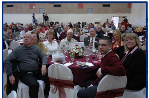
Over 500 Hawthorne residents and business members attended the event